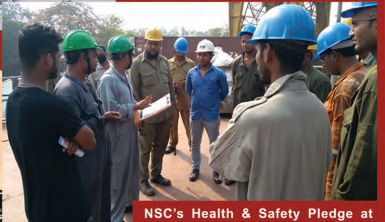
NSC's Health & Safety Pledge at FOJ Unit on 05 Mar 18