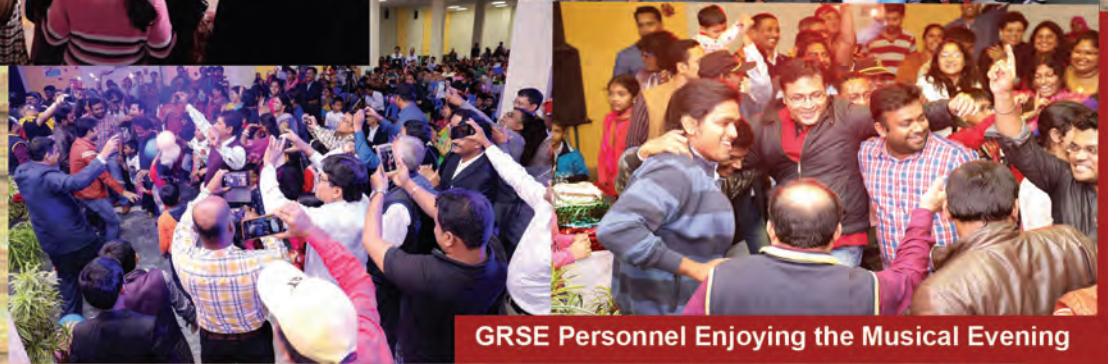
GRSE Personnel Enjoying the Musical Evening