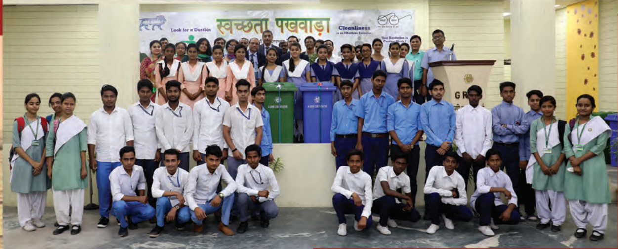
Distribution of Waste Bins to Local Schools