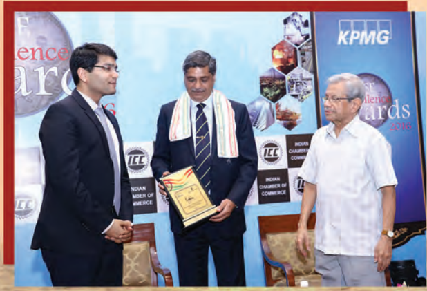
ICC PSE Excellence Award 2016 in the Categories of "Company of the Year", "Corporate Governance", "Human Resource Management Excellence", "CSR & Sustainability" & "Contribution of Women in PSEs" on 07 Sep 17