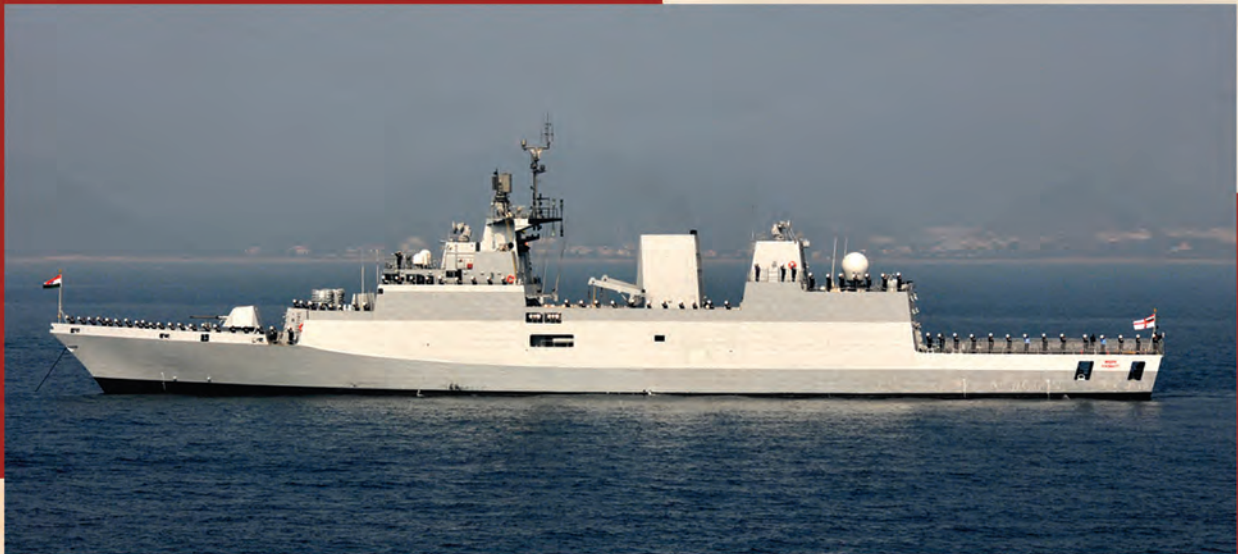
The Superstructure of INS Kiltan (3 rd Anti Submarine Warfare Corvette) has been made of Carbon Fibre Composite Material and is Integrated with the Steel Hull of the Ship. GRSE is the First Shipyard in the Country to have achieved this feat. This feature of INS Kiltan has reduced the Overall Weight of the Ship