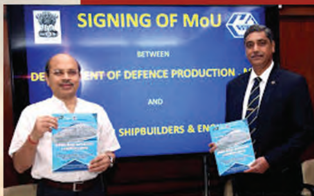
MoU between GRSE & Department of Defence Production for FY 17-18