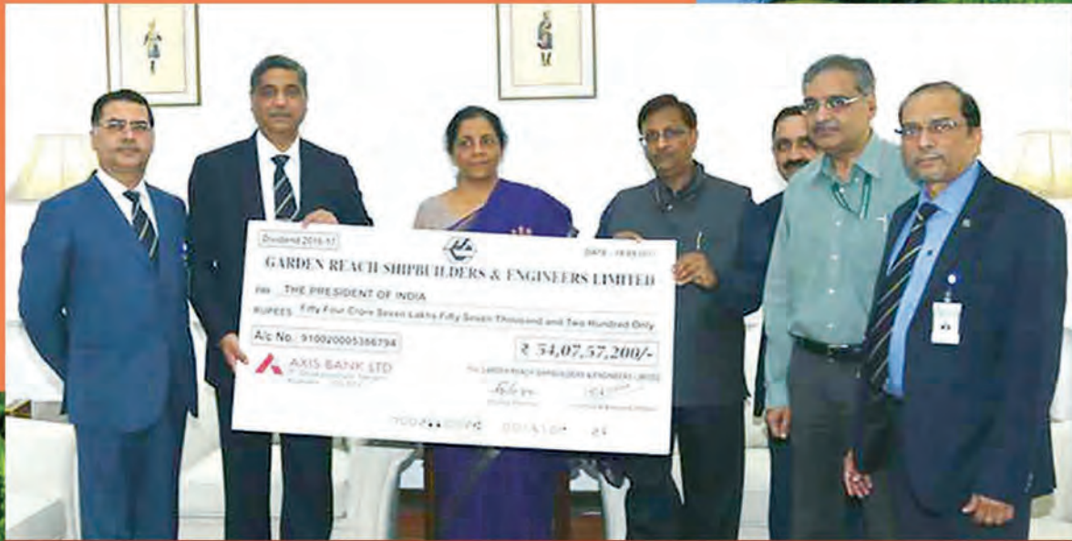
Handing Over of Dividend Cheque to Hon'ble Raksha Mantri, Smt. Nirmala Sitharaman on 28 Feb 18