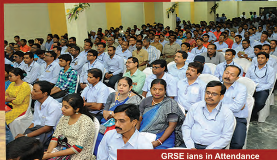
GRSE ians in Attendance