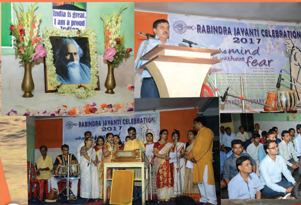
Rabindra Jayanti Celebration