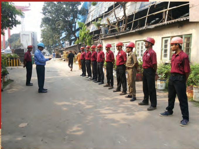
NSC's Health & Safety Pledge at Fire Station, Main Unit on 05 Mar 18