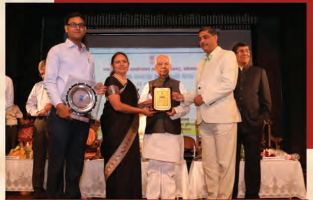
GRSE received TOLIC Awards 2016-17 for Excellence in Official Language Implementations on 12 Aug 17