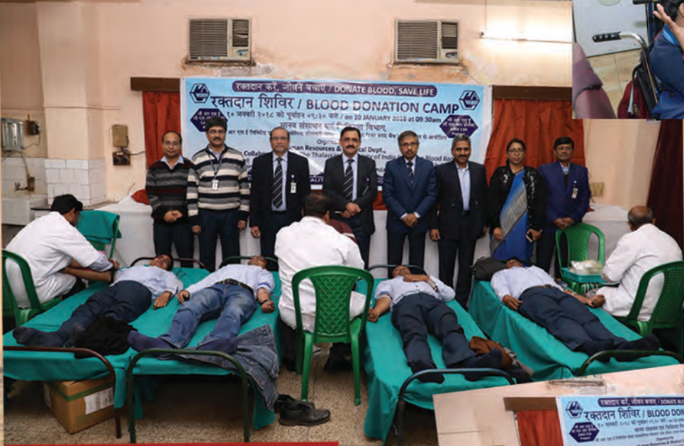
Blood Donation Camp on 10 Jan 18