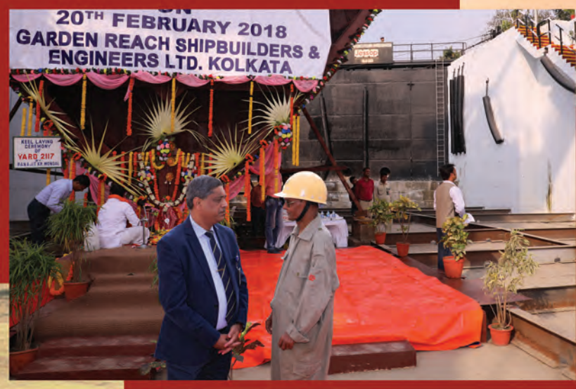
Keel Laying of the 5 th Fast Patrol Vessel – Yard 2117 under the FPV Project for Indian Coast Guard at GRSE RBD Unit on 20 Feb 18