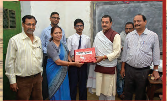
Hindi Competition in Lajpat Hindi High School, Kolkata on 17 Nov 17