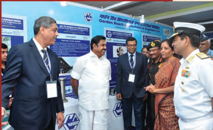
CMD GRSE shares a light moment with Hon'ble Raksha Mantri, Smt. Nirmla Sitharaman and other Indian Navy Personnel in the Vendor Development Meet Exhibition for OFB & DPSUs at Kalaivanar, Arangam, Chennai from 18 to 19 Jan 18