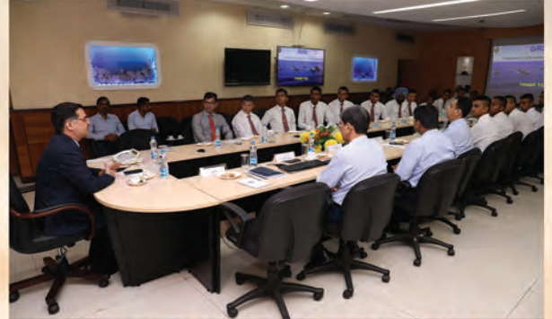
Cadets of Officers Training Academy of Gaya visited GRSE on 15 Sep 17