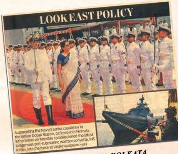
Augmenting the Navy's strike capability in the Indian Ocean Region, defence min Nirmala Sitharaman on Monday commissioned the latest indigenous anti-submarine warfare corvette, INS Kiran, into the force at Visakhapatnam.

THE ECONOMIC TIMES, KOLKATA TUESDAY, OCTOBER 17, 2017