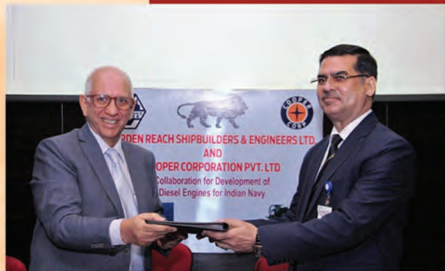
MoU between GRSE & M/s Cooper Corporation for Production of Small Capacity Marine Diesel Engines on 16 Oct 17