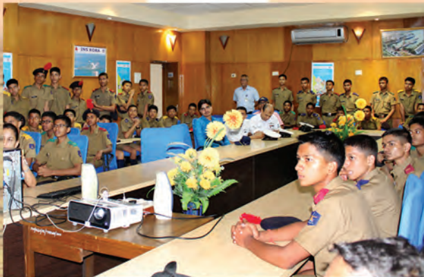
Cadets of Sainik School, Purulia, WB visited GRSE on 29 Apr 18