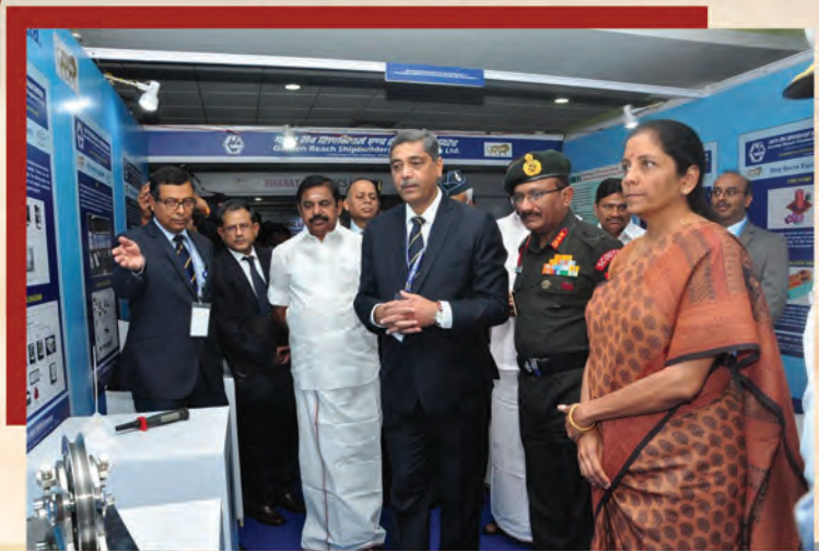
Hon'ble Raksha Mantri, Smt. Nirmla Sitharaman at the GRSE Stall in the Vendor Development Meet Exhibition for OFB & DPSUs at Kalaivanar, Arangam, Chennai from 18 to 19 Jan 18