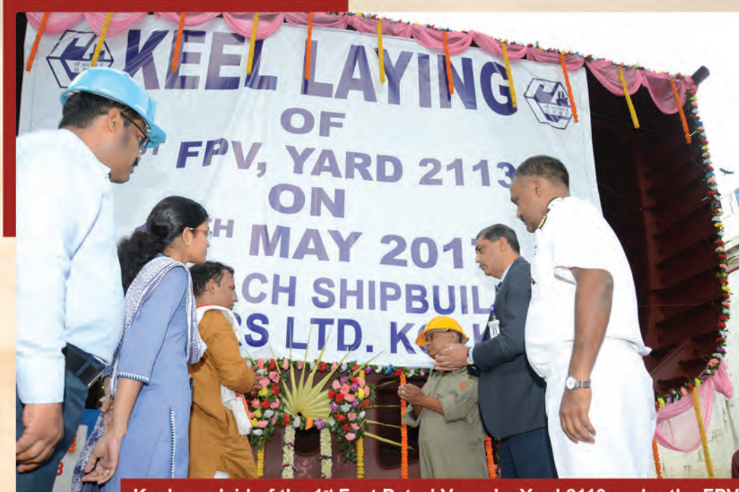
Keel was laid of the 1 st Fast Patrol Vessel – Yard 2113 under the FPV Project for Indian Coast Guard at GRSE RBD Unit on 15 May 17