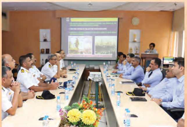
WPS Conclave at GRSE on 03 May 18