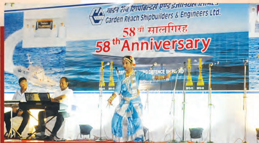
Cultural Performance in Progress