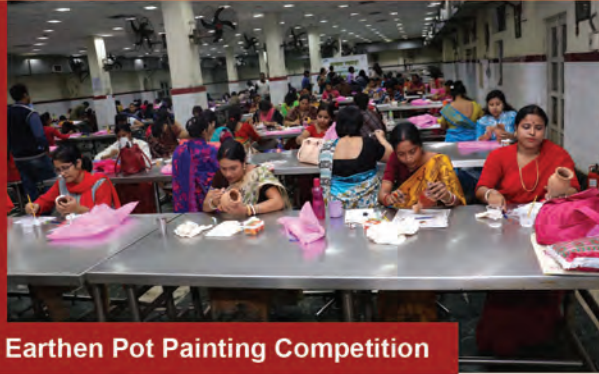
Earthen Pot Painting Competition

A fun filled day with Employees' Children and Families