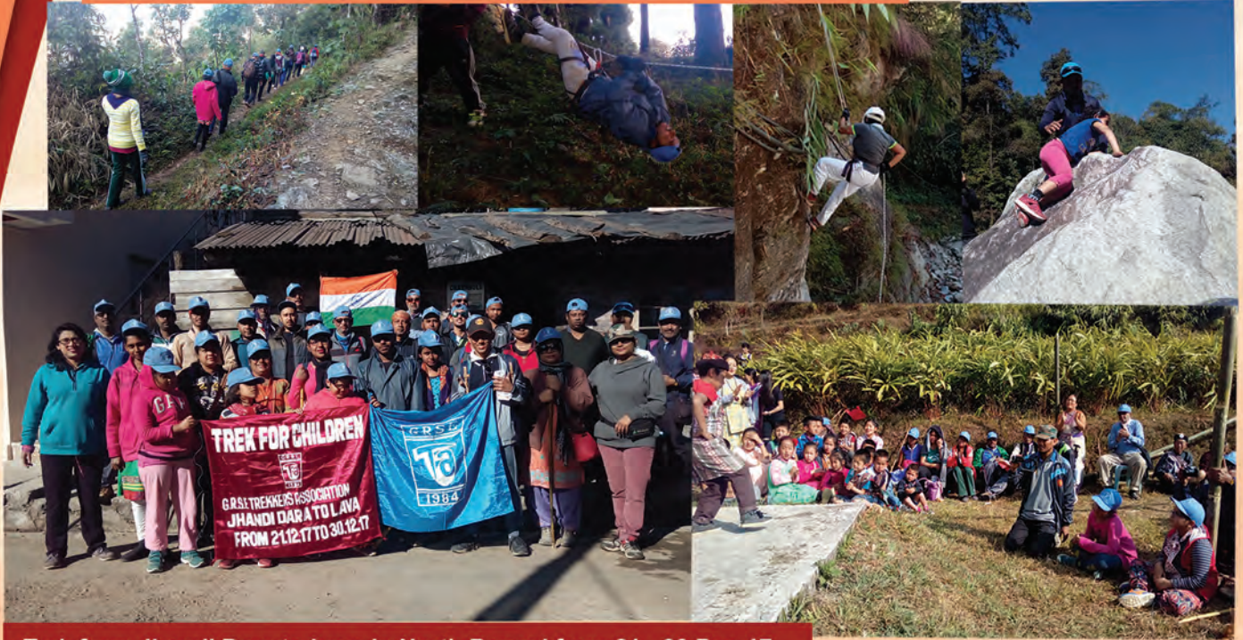
Trek from Jhandi Dara to Lava in North Bengal from 21 - 30 Dec 17