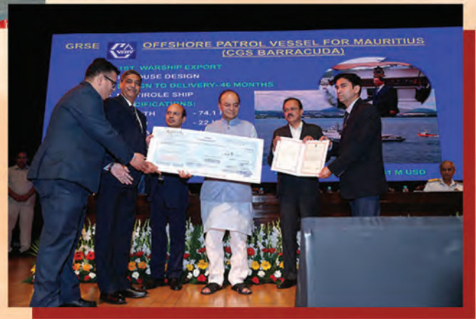
Raksha Mantri's Award for Excellence 2015-16 for In-House Design Effort for Offshore Patrol Vessel for Mauritius – CGS Barracuda on 30 May 17