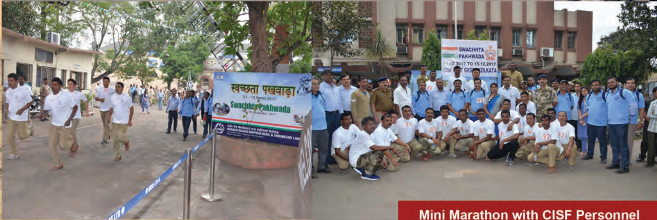
Mini Marathon with CISF Personnel