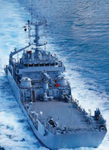
IN LCU L-54