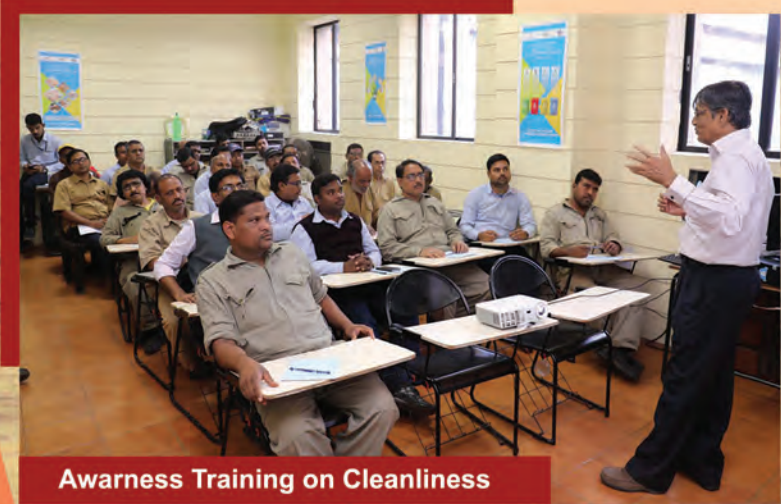
Awarness Training on Cleanliness