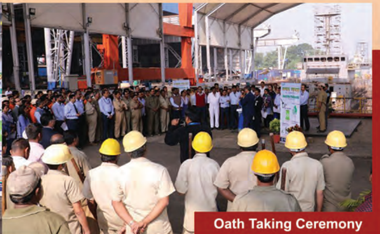
Oath Taking Ceremony