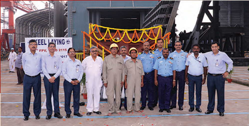
Keel Laying of the 3 rd & 4 th Fast Patrol Vessel – Yard 2115 & Yard 2116 under the FPV Project for Indian Coast Guard at GRSE Main Unit on 30 Oct 17