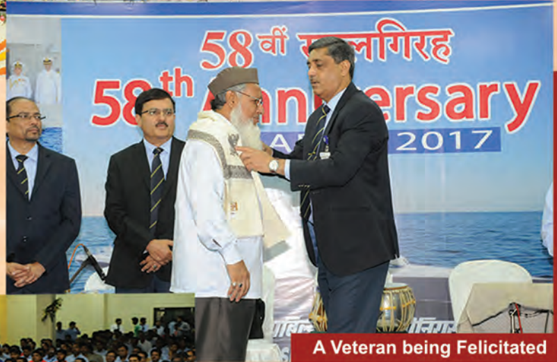
A Veteran being Felicitated