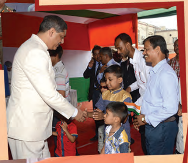
Republic Day 2018