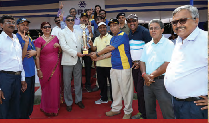
Prize Distribution for GRSE Annual Sports on 03 Mar 18