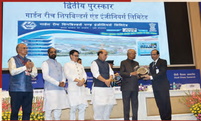
Hon'ble President of India, Shri Ram Nath Kovind presented the Rajbhasha Kirti Puraskar to GRSE for 2016-17 for Excellence in Official Language Implementation on 14 Sep 17