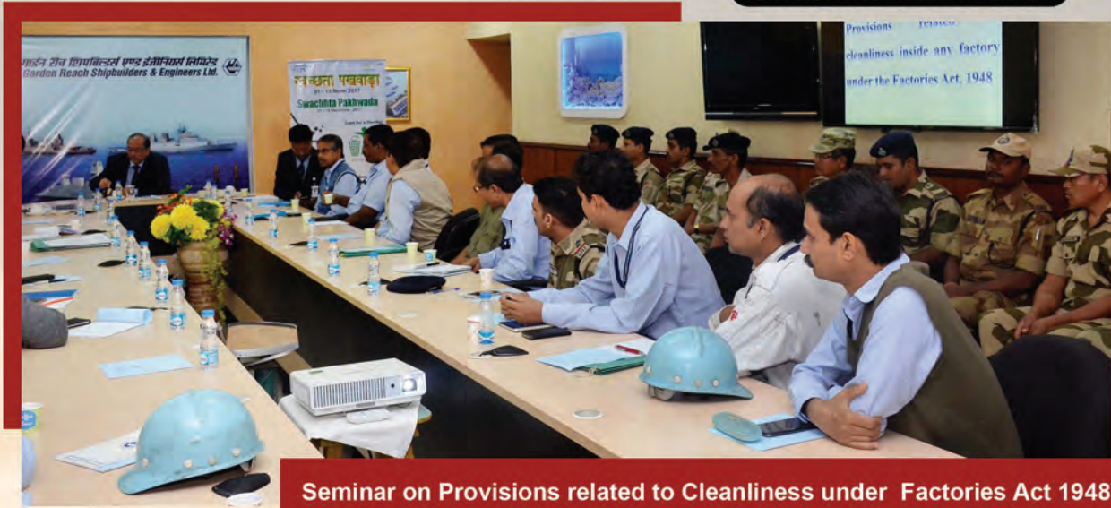
Seminar on Provisions related to Cleanliness under Factories Act 1948