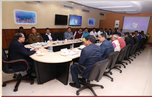
Officers from Defence Institute of Quality Assurance visited GRSE on 11 Jan 18