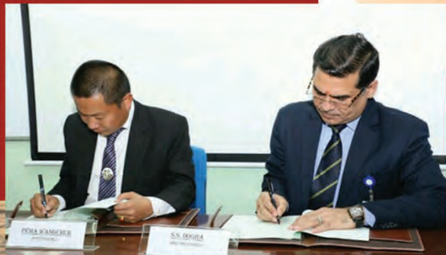
MoU between GRSE & M/s CDCL Ltd., Bhutan for Supply of Components of Portable Steel Bridges on 19 Mar 18