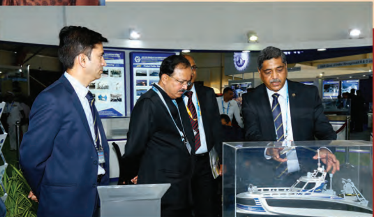
Hon'ble Raksha Rajya Mantri, Dr. Subhash Ramrao Bhamre visited the GRSE Stall at DEFEXPO 2018 Exhibition at Chennai from 11 to 14 Apr 18