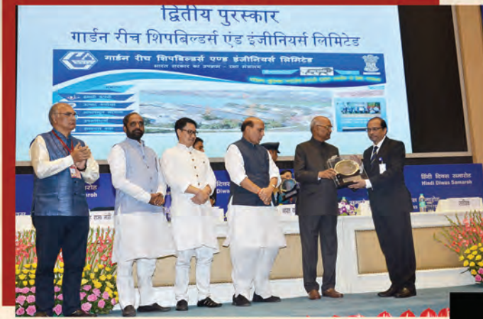
Hon'ble President of India, Shri Ram Nath Kovind presented the Rajbhasha Kirti Puraskar for 2016-17 to GRSE on 14 Sep 17 for Excellence in Official Language Implementation