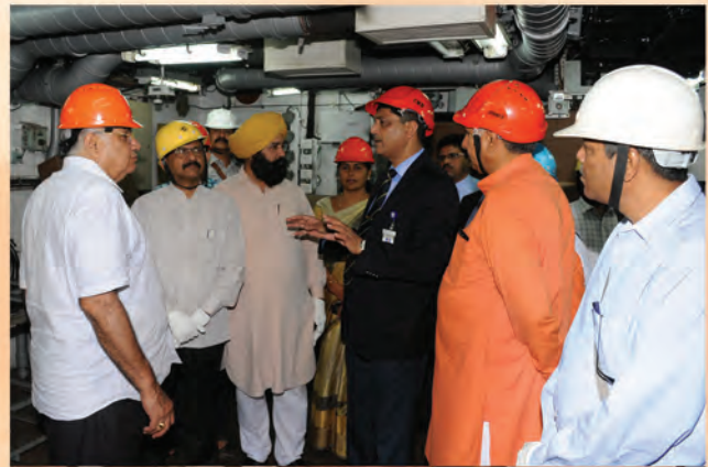
Parliamentary Standing Committee on Defence visited GRSE on 26 Apr 17