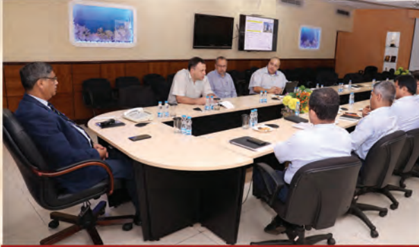
Delegation from Elbit Systems, Israel visited GRSE on 23 May 18