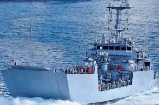
IN LCU L-53