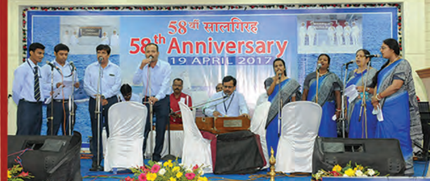
Musical Soiree in Progress