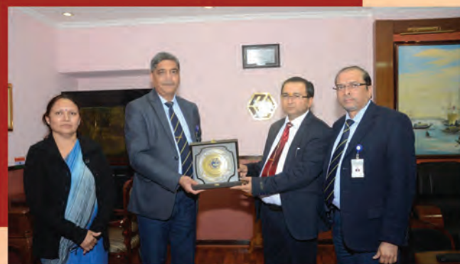
Chairman, CSTT (Commission for Scientific and Technical Terminology) visits GRSE on 20 Dec 17