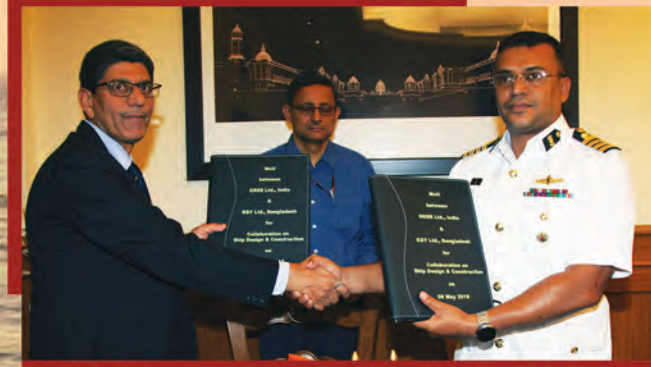
MoU between GRSE & M/s Khulna Shipyard (KSY), Bangladesh for Design & Construction of Ships on 08 May 18