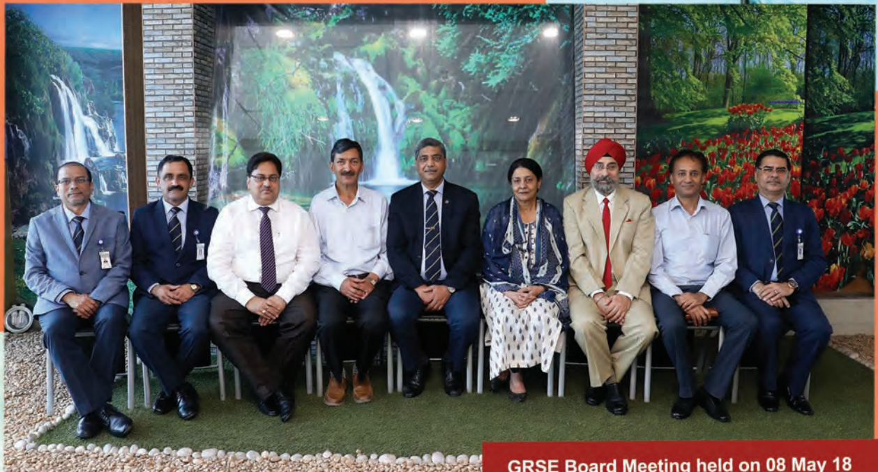
GRSE Board Meeting held on 08 May 18

Design, Concept & Editing: C&CP Department, Garden Reach Shipbuilders & Engineers Ltd. 43/46, Garden Reach Road, Kolkata – 700024. website : www.grse.in