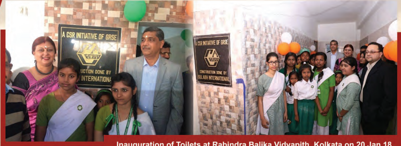
Inauguration of Toilets at Rabindra Balika Vidyapith, Kolkata on 20 Jan 18