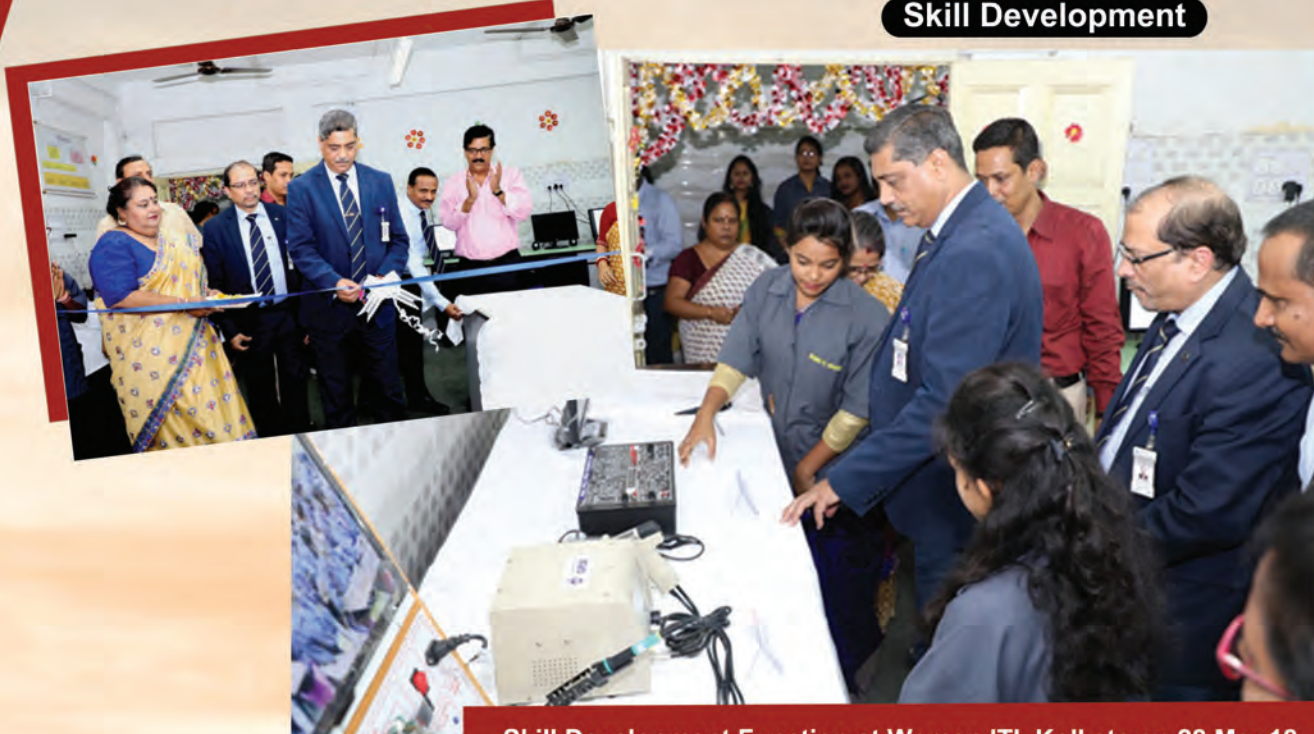
Skill Development Function at Women ITI, Kolkata on 28 Mar 18