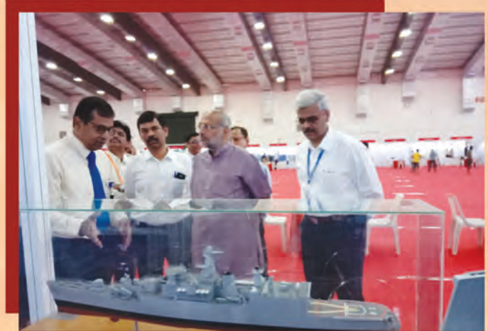
GRSE participated in the Defence Indigenization Expo 2018 for OFB & DPSUs at Coimbatore from 05 to 06 Mar 18