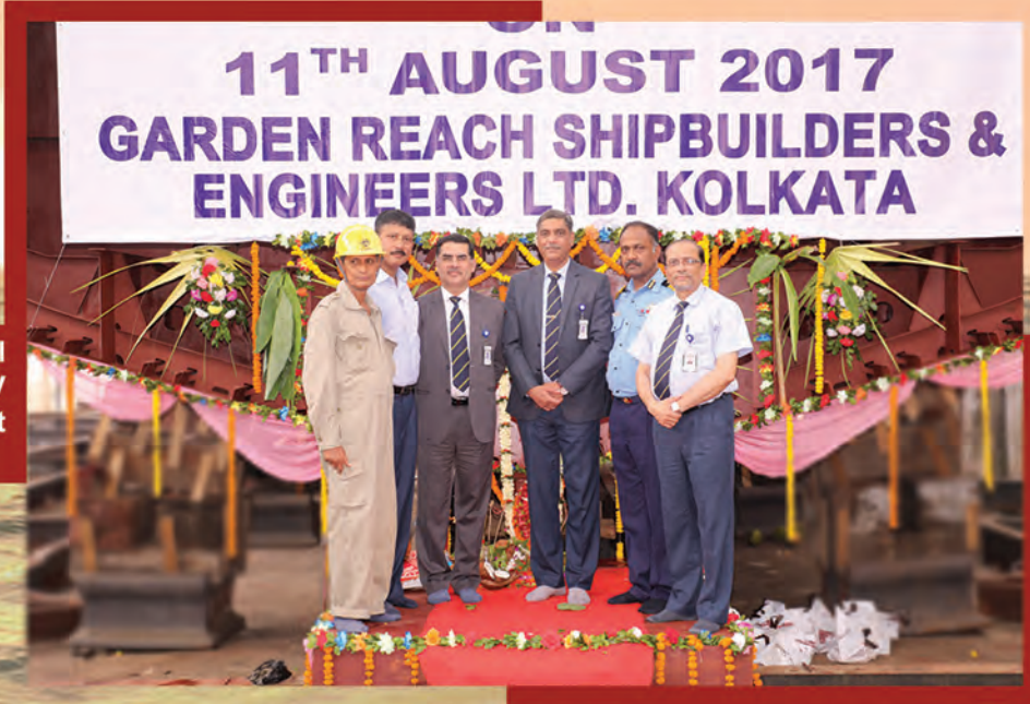
Keel Laying of the 2 nd Fast Patrol Vessel – Yard 2114 under the FPV Project for Indian Coast Guard at GRSE RBD Unit on 11 Aug 17