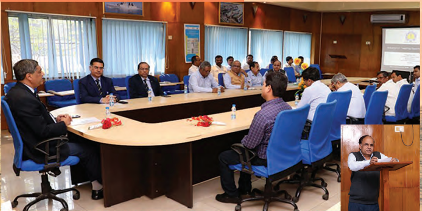
Productivity Competition held at GRSE from 12-18 Feb 18

The Most Effective Way To Do It, Is To Do It