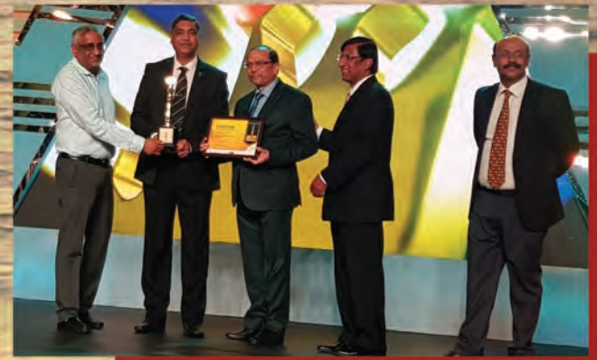
Economic Times Bengal Corporate Awards 2018 in the Category of "CSR" on 16 Mar 18