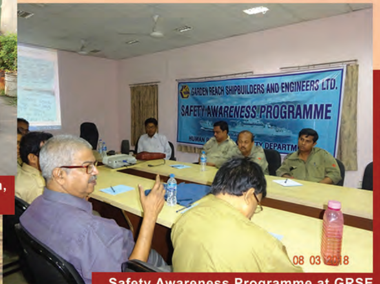
Safety Awareness Programme at GRSE Main Unit on 08 Mar 18