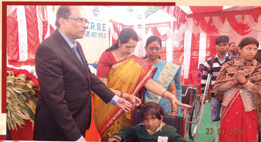
Assistive Aids for Differently Abled Persons at Ranchi, Jharkhand on 27 Jan 18