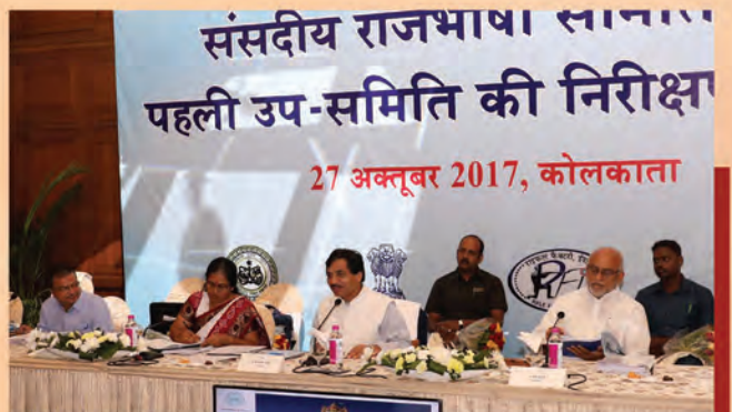
Inspection of GRSE by Parliamentary Sub-Committee on Official Language on 27 Oct 17