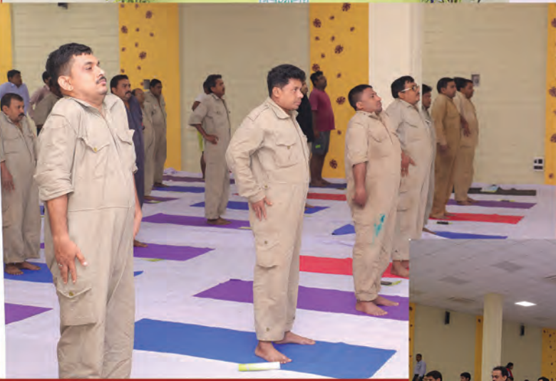
International Yoga Day was observed on 21 Jun 17