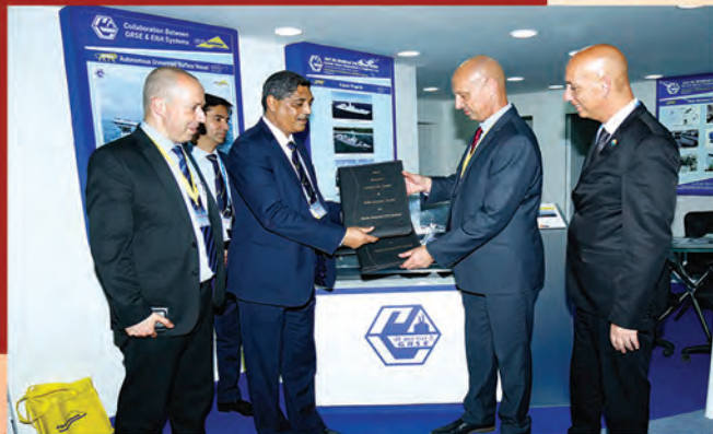
MoU between GRSE & M/s Elbit Systems Ltd, Israel for Indigenous Development of Unmanned Surface Vessel (USV) on 12 Apr 18