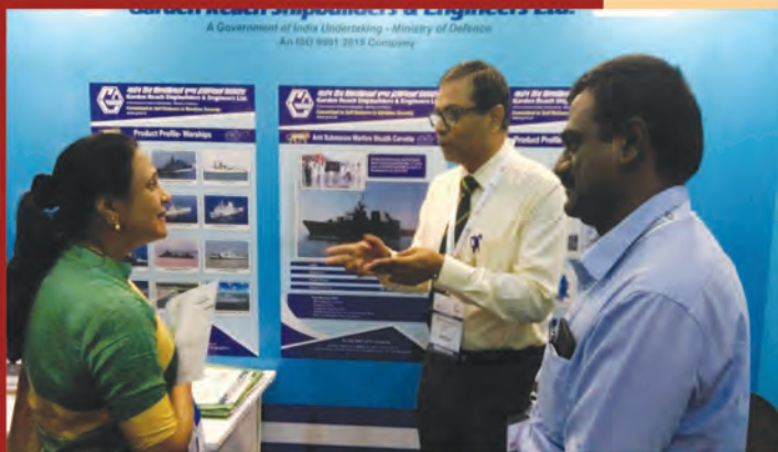
GRSE participated in NIMA Index 2018 Exhibition at Mumbai from 03 to 05 May 18