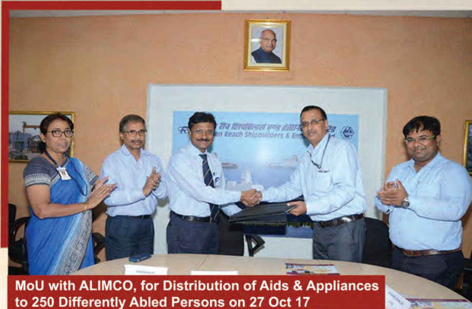
MoU with ALIMCO, for Distribution of Aids & Appliances to 250 Differently Abled Persons on 27 Oct 17