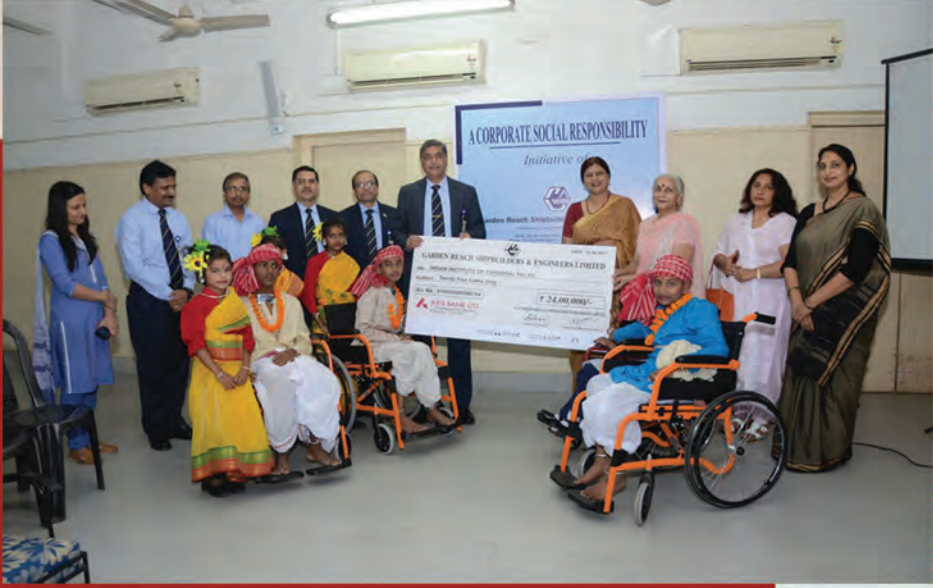
Presentation of Cheque to Indian Institute of Cerebral Palsy on 04 Sep 17