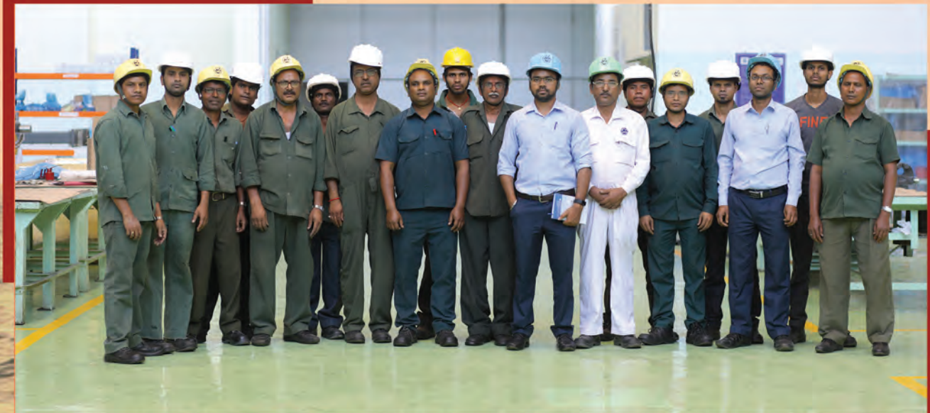
GRSE is gearing to manufacture Engine Parts up to 40% Indigenization level over the next 4-5 years, in line with the Make in India drive of the Govt. of India