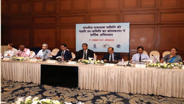
Inspection of GRSE by Parliamentary Sub-Committee on Official Language on 27 Oct 17