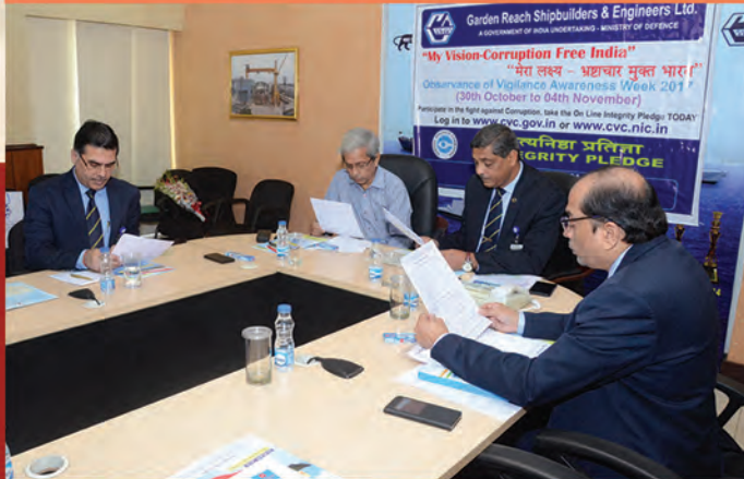
Vigilance Awareness Week was observed on 31 Oct 17

Rather Fail With Honor Than Succeed By Fraud