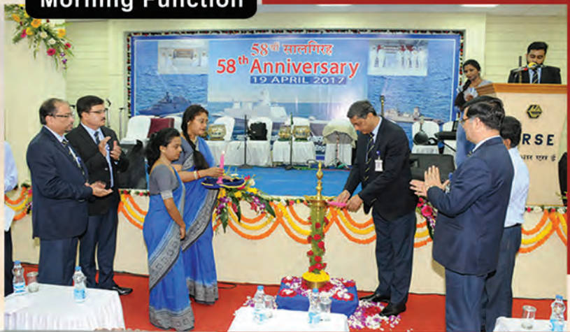
Lighting of the Traditional Lamp by CMD