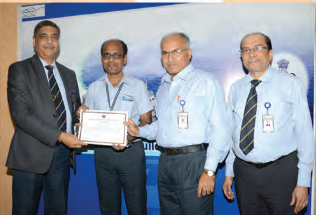
OLIC Meeting & Award distribution of Quarterly Incentive Scheme on 20 Jun 17