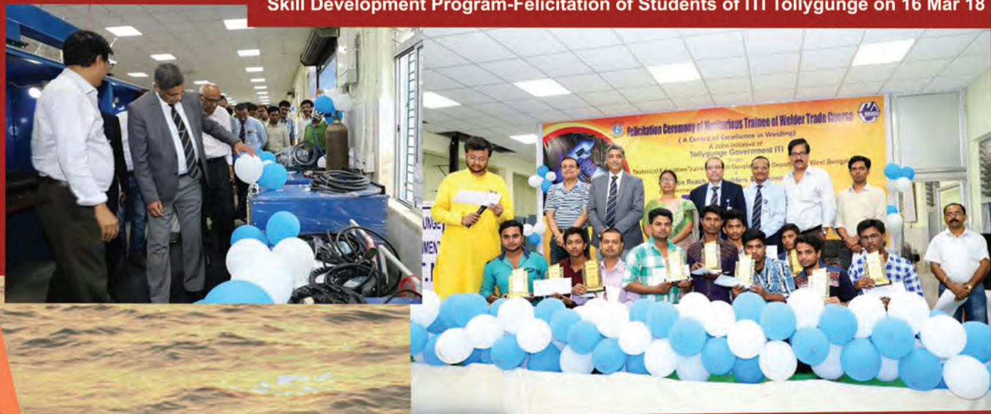
Skill Development Program-Felicitation of Students of ITI Tollygunge on 16 Mar 18